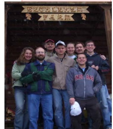
Spring Break 2007—The Crew

The most important thing that I gained from the trip was the ability to give my heart to God. I discovered that God will help you and guide you if you open your heart to him. Going on this trip gave me a brand new outlook on life. I am a much happier person since going on the spring break trip. My life has been forever changed.